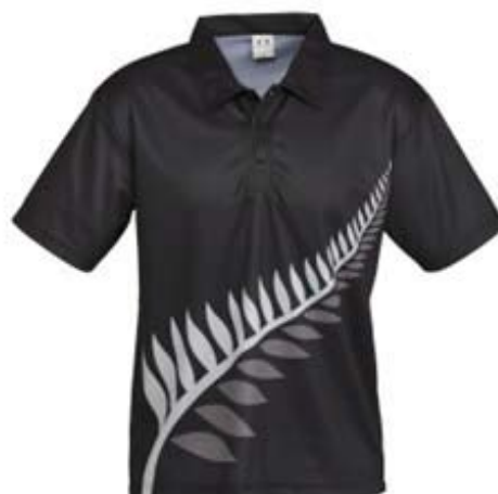
FB-P116MS Polo Shirt with large silver fern $34.10 Buy 20: $32.00