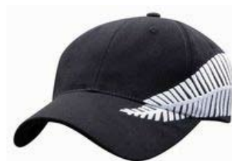
PS-4355 Cap with silver fern (Minimum 10 units) $8.95 Buy 20: $7.90