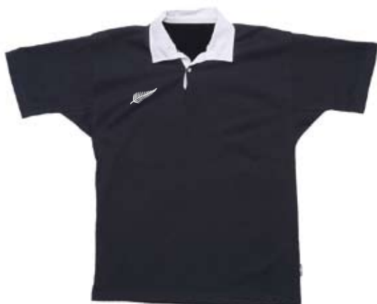
B-RBJ Short Sleeve Rugby Jersey with silver fern $46.00 Buy 20: $43.50