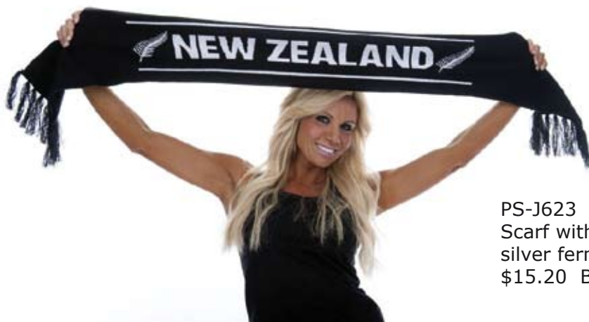
PS-J623 Scarf with New Zealand & silver fern $15.20 Buy 20: $13.75

Especially for those wanting to show their patriotism this year we have some great new product ready branded with silver fern imagery. Co-brand it with your corporate or team name or logo and you've got the perfect promotional gift or supporter's uniform for this year's big event.