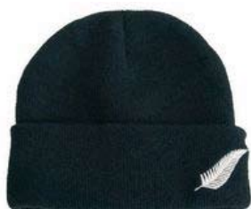
PS-4229sf Beanie with silver fern (Minimum 10 units) $6.55 Buy 20: $5.75