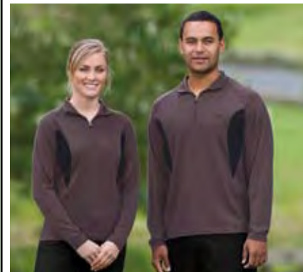
Contoured Pullover (EGCP & WEGCP) Colours: taupe/black Mens S - 5XL from $100.40 Womens 8/XS - 18/XXL from $100.40

For more Great Eco Gear™ Merino styles go to www.essentialsapparel.com