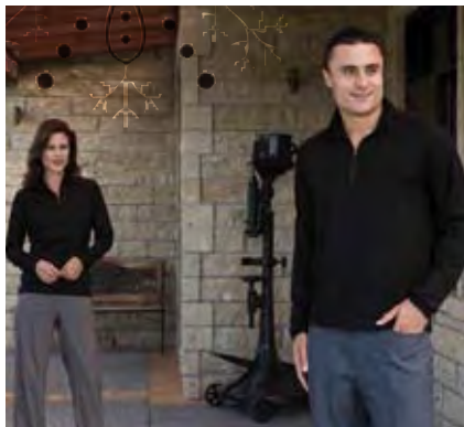
Merino Zip Pullover (EGMZ & WEGMZ) Colours: black, navy Mens S - 5XL $100.40 Womens 8/XS - 18/XXL $100.40