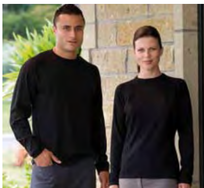
Merino Crew Pullover (EGMC & WEGMC)