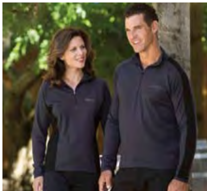
Merino Zip Pullover (EGMZ & WEGMZ) Colours: charcoal/black Mens S - 5XL $100.40 Womens 8/XS - 18/XXL $100.40