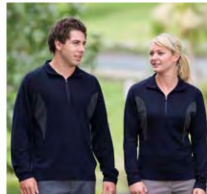
Contoured Pullover (EGCP & WEGCP) Colours: navy/charcoal Mens S - 5XL from $100.40 Womens 8/XS - 18/XXL from $100.40