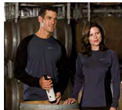
Merino Crew Pullover (EGMC & WEGMC)